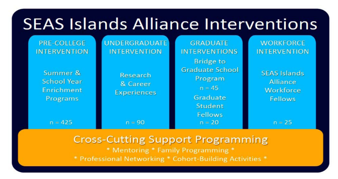
Figure 2. The SEAS Islands Alliance Interventions

Over the five years of funding, the SEAS Alliance will support i) middle/high school students in summer and school year geoscience enrichment programs, ii) undergraduate students in early-career research and career experiences, iii) upper-level undergraduate and/or master's students in an 8-week summer intensive Bridge to Graduate School Program, iv) Bridge Program students who will receive graduate training at partnering institutions (MS or PhD. levels), and v) Island Alliance Fellows in local workforce positions in each of the island hubs.